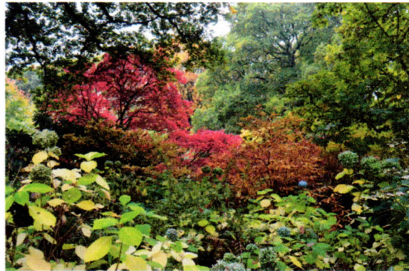
Outstanding Autumn Colour