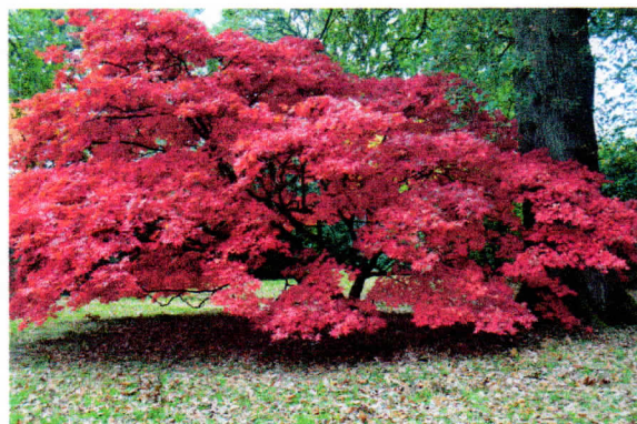
Acer Palmatum 'Osakasuki'