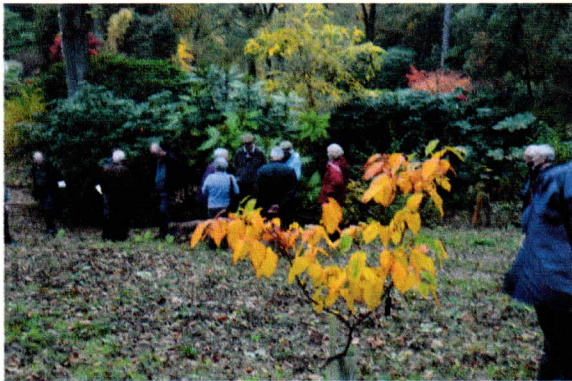
A young Franklinia Alatomaha