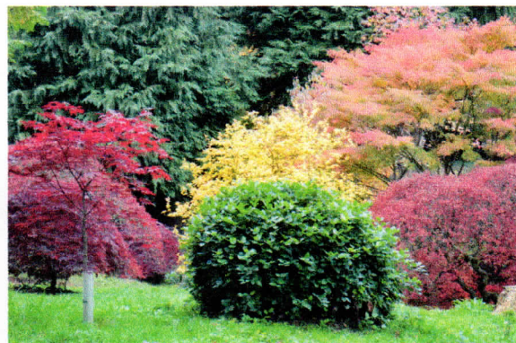
Incredible Autumn Colour

The outstanding plant in the Acer Glade was tall 'Seiryu', still displaying bright yellow cascades of foliage. Nearby, in an island bed, the intense silver foliage of an excellent form of Rhododendron pachysanthum provided brilliant contrast to the red hues. Several Blue Atlas Cedars ( Cedrus atlantica 'Glauca') gave a similar effect on the wider scale.